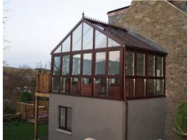
The finished conservatory.....and the spectacular views from it.

We are sure you will agree the results are stunning. The Rosewood conservatory and decking area are a beautiful addition to the house, and it is practical too, with tilt'n'turn windows for easy cleaning and an easy-clean heat-reflective glass roof to make the most of the light and reduce noise from the road.