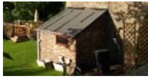
Site of new workshop & conservatory

We also have a wide range of accessories for you to add a personal touch to your new door. And as all our doors are manufactured using an advanced technology, this means that they will not bow, warp or